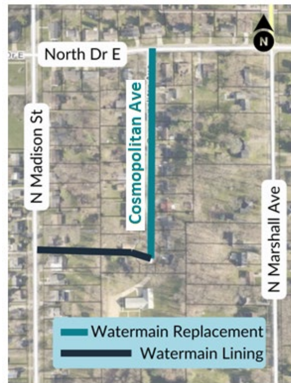
Figure 1: Watermain Replacement and Lining Locations

Reconstruction Project will commence on Cosmopolitan Avenue from North Drive East to the cul-de-sac. The City will provide additional details about the Watermain Replacement project before construction begins later this spring.